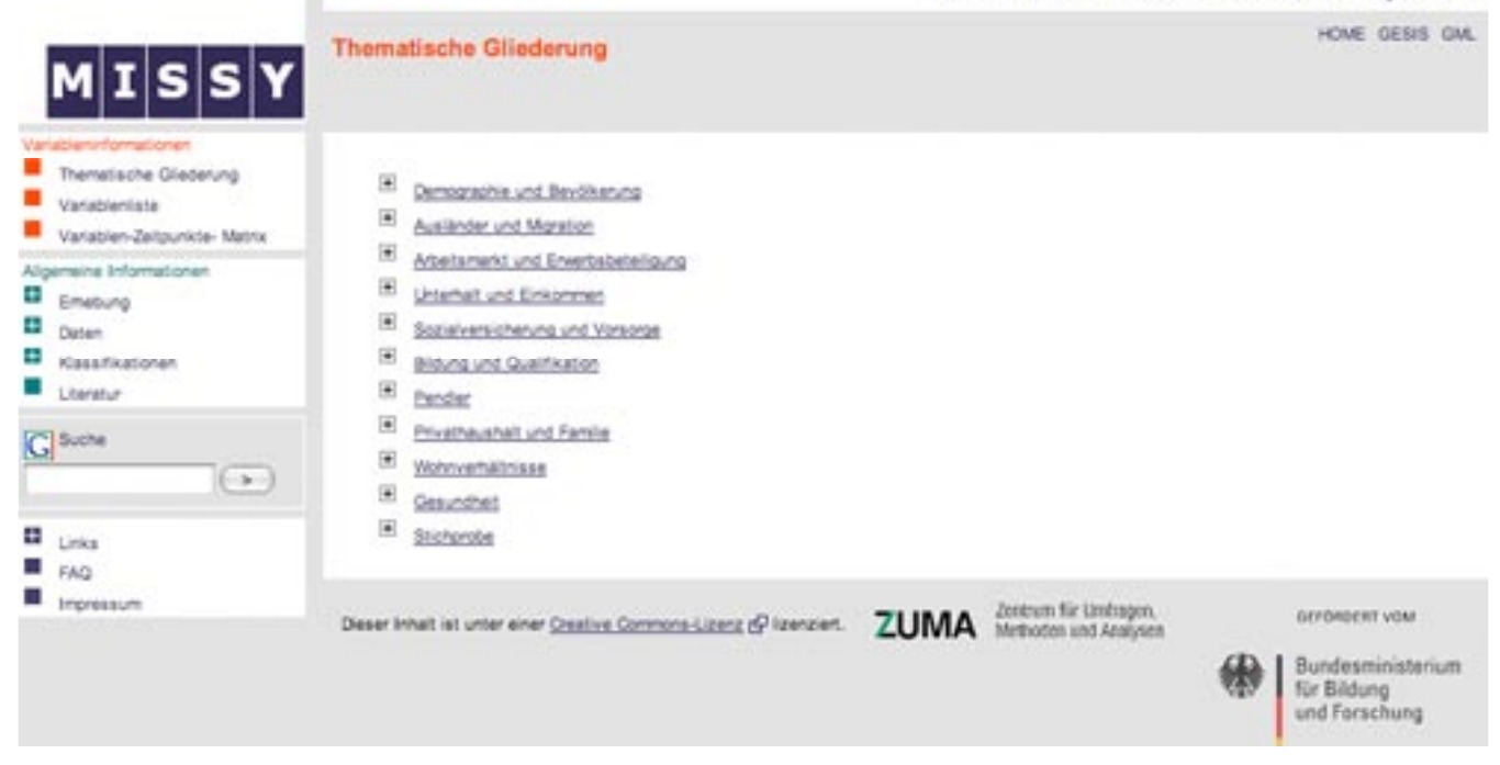
Figure II: Thematic Structure

interested in a specific subject or field of research and wants to know if the Microcensus has relevant content. To start with, the researcher may choose from eleven topics leading to the secondary level; at this point there are two links. The first is to publications based upon the Microcensus that pertain to specific subjects, "ethnic minorities and migration" being one example (see fig. II). This makes it easy for the investigator to determine what research might be undertaken or see what research has already been done based on the Microcensus. The second link connects to tables containing examples of analyses. Again, using "ethnic minorities and migration" as an example, the user will find multiple tables including one which shows a comparison of the graduation rates between the German and Turkish population. The tables were created to assist novice data users, e.g. students. The aim is to encourage researchers and future researchers to use official microdata in their analysis.