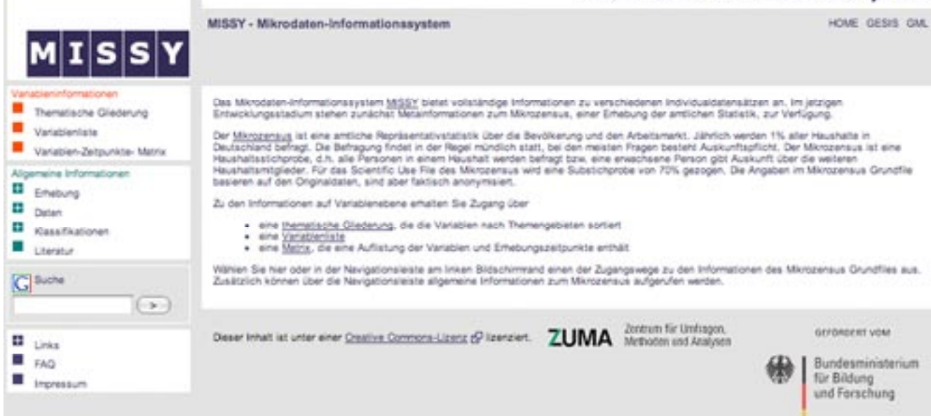
Figure I: MISSY

MISSY facilitates research based on the German Microcensus. Gathering all the necessary metadata incorporating the knowledge of the GML is the first step; this includes official documents of the Federal Statistical Office. The second step is one that connects all the metadata in a way that considers the textual relationships between the data and the enquiries of social scientists and economists. The implementation accomplished by MISSY is based on the DDI (Data Documentation Initiative) 2.1 standard.