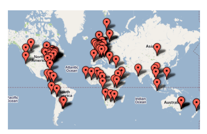
Figure 2: Organizations using DDI

The specification itself was designed to be modular and to document and manage different stages of the data lifecycle. It was predicated on the principle of reusing metadata to eliminate costly redundancies and support explicit comparison (Vardigan, Heus, and Thomas, 2008). As Green and Humphrey note, "enter once and use many times" is a powerful paradigm, which DDI 3 exploited through referencing. As an example, response categories can be defined once and then used multiple times by both questions and variables